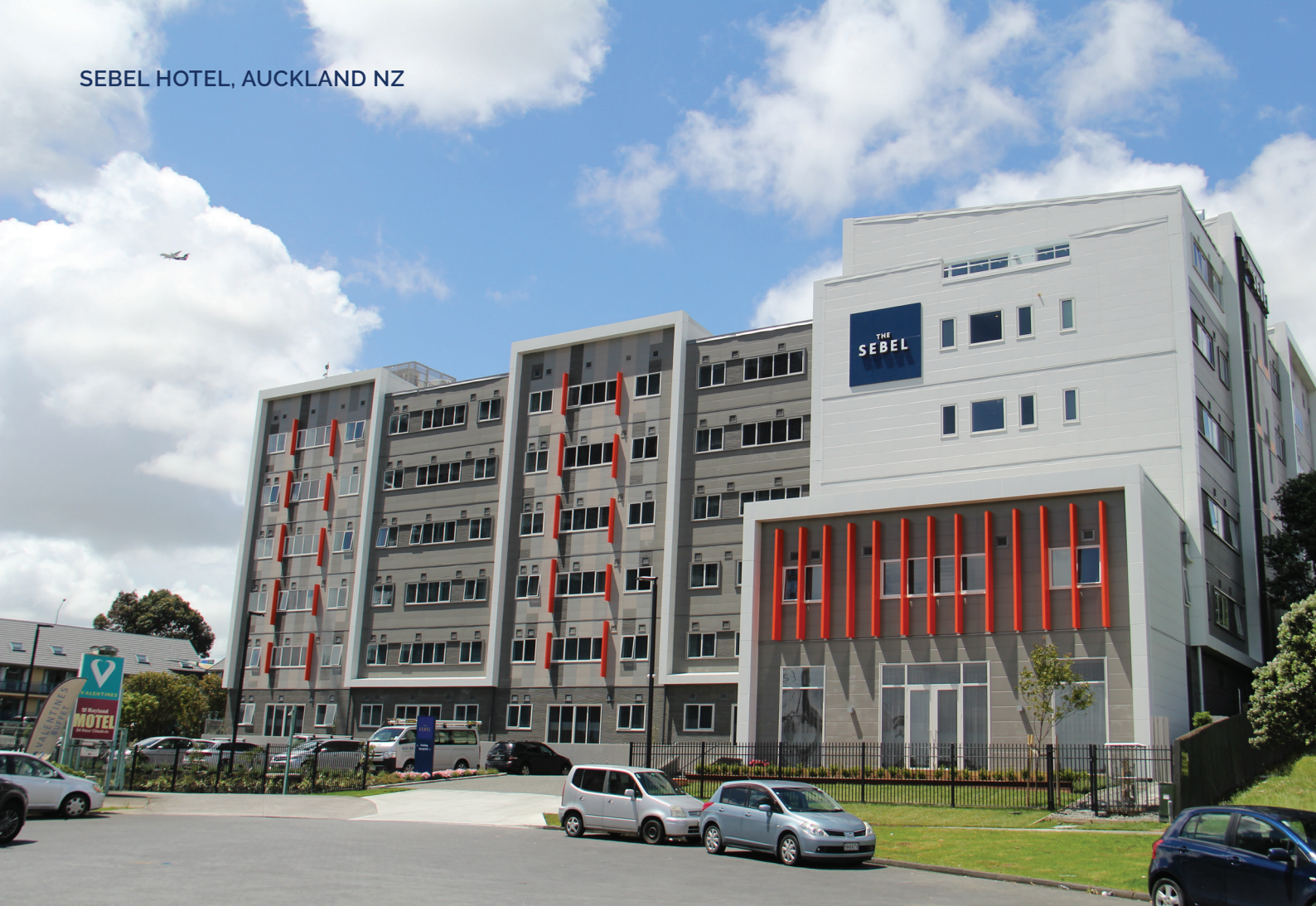
SEBEL HOTEL, AUCKLAND NZ