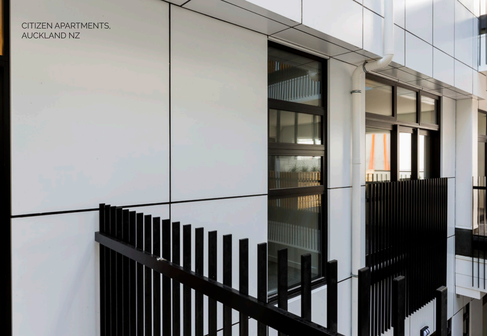
CITIZEN APARTMENTS, AUCKLAND NZ