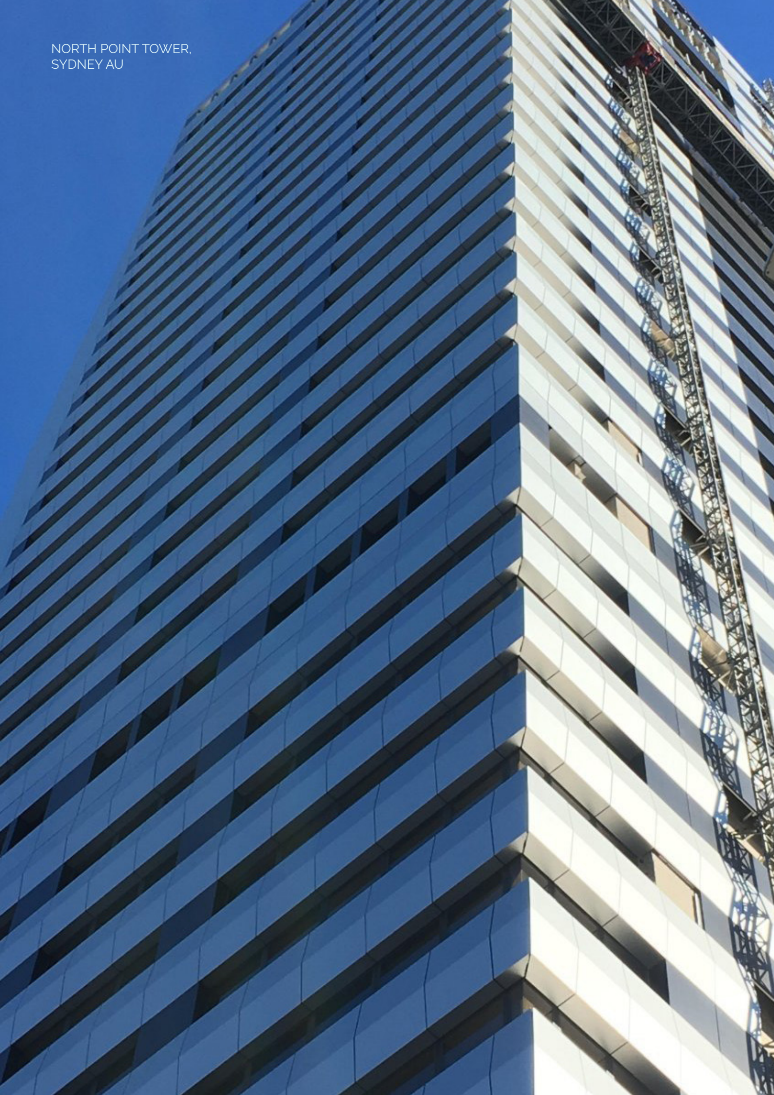
NORTH POINT TOWER, SYDNEY AU