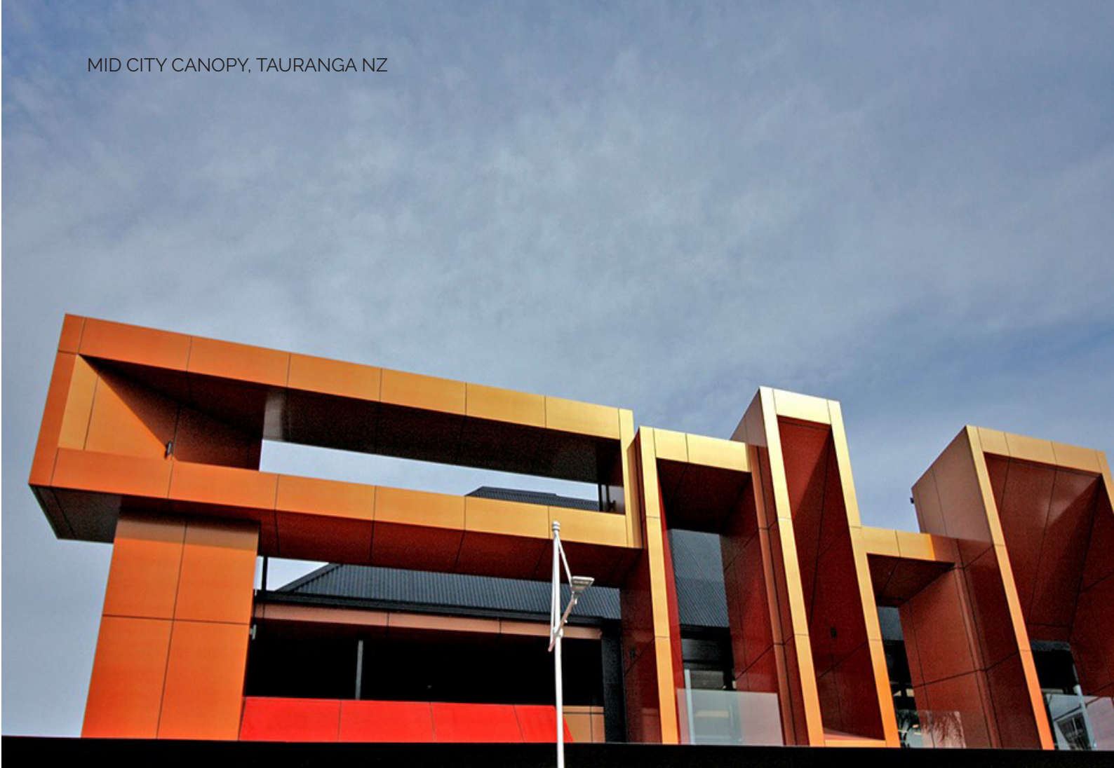
MID CITY CANOPY, TAURANGA NZ